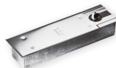
High-grade, stainless-steel cover